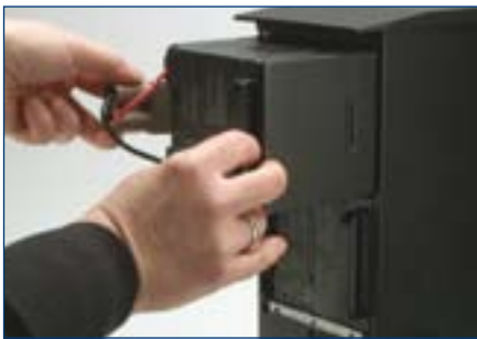
User-friendly, hot-swappable battery replacement

Hot-Swappable, User Replaceable Batteries allow continuous operation of the load when batteries are being replaced by the end user.