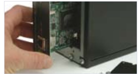
APC accessory cards can be inserted into the built-in SmartSlot to allow monitoring of power conditions. The Smart-UPS RT 5000, 8000, and 10,000 units ship bundled with the Web/SNMP Management Card

Built-in SmartSlot houses APC's accessory cards, which increase overall system manageability through timely notification of hazardous conditions.