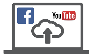
Upload to social media (Windows only)