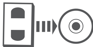
Converts VHS to DVD/VCD