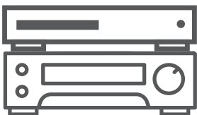
Supports various A/V devices