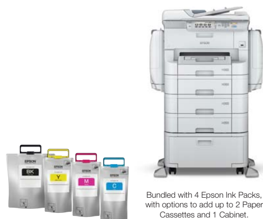
Bundled with 4 Epson Ink Packs, with options to add up to 2 Paper Cassettes and 1 Cabinet.