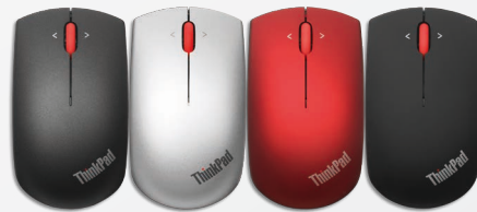
ThinkPad Precision Wireless Mouse - Midnight Black 0B47163, ThinkPad Precision Wireless Mouse - Heatwave Red 0B47165, ThinkPad Precision Wireless Mouse - Frost Silver 0B47167, ThinkPad Precision Wireless Mouse - Graphite Black 0B47168, ThinkPad Precision USB Mouse - Midnight Black 0B47153