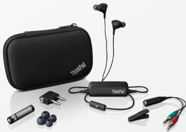
ThinkPad® Noise-Cancelling Earbuds (0B47313)