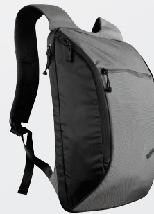
ThinkPad® Ultralight Backpack (0B47306)