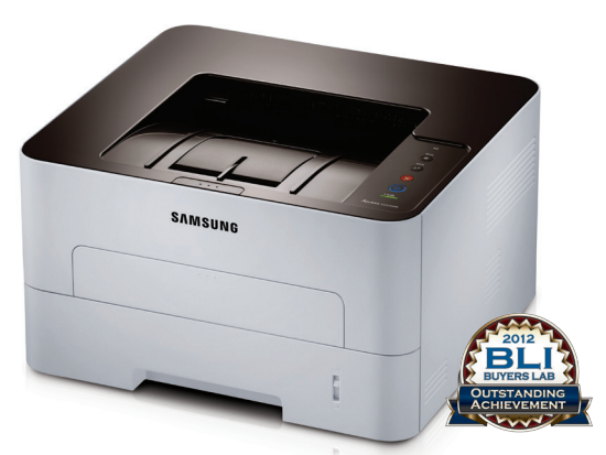
Outstanding Achievement in Innovation: Samsung Easy Eco Drive